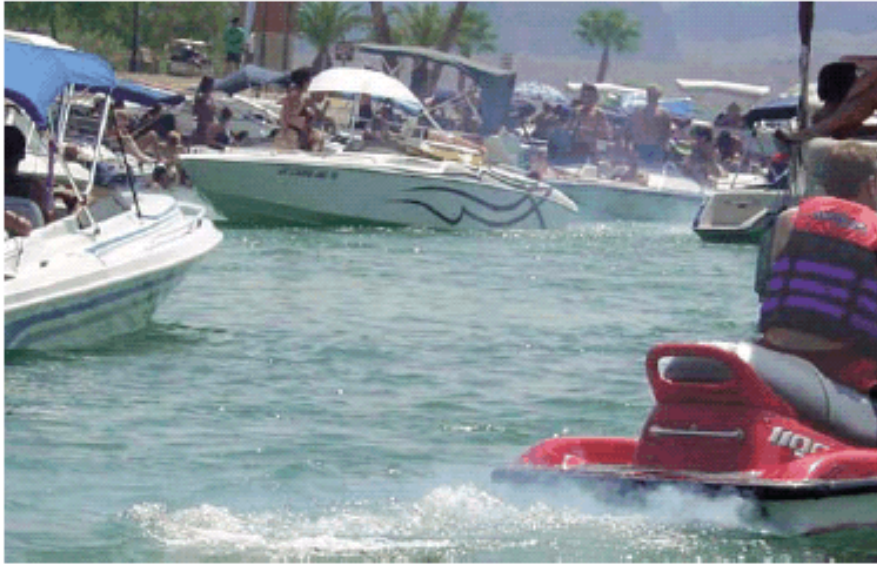
FIGURE. Vacationers during a holiday weekend in the Bridgewater Channel of Lake Havasu, where carbon monoxide levels were found to be elevated — Lake Havasu City, Arizona, 2003